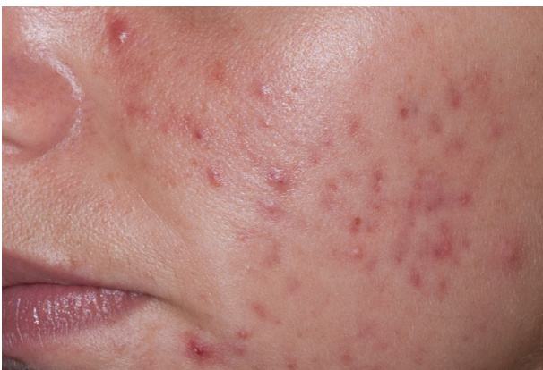
Figure 3. Acne patient with inflammatory lesions.

Inflammation is a major feature of many different skin diseases, including: acne (Fig. 3), rosacea (Fig. 4), dermatitis, actinic keratosis and psoriasis. To target inflammation in these conditions, it is often treated with a variety of topical and systemic agents 4,5 . In the recent years though, light therapy (phototherapy) is becoming increasingly popular for treating inflammatory skin diseases 6 and fluorescent light energy (FLE) offers a non-destructive and non-systemic alternative that stimulates the skin's own repair mechanism.